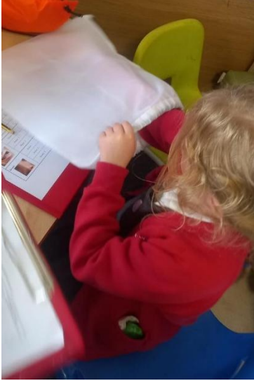
What can I feel in the bag?