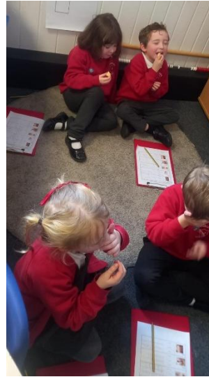
We recognised the taste of some foods