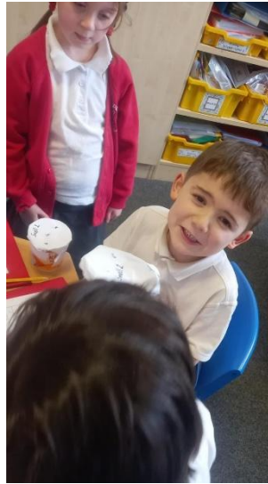
We didn't like all of the smells