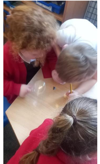
Tiny objects can be hard to see